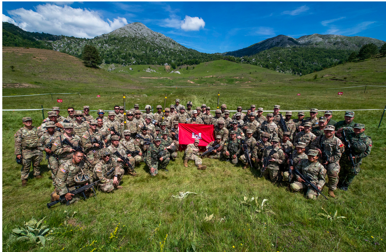
Below: U.S. Army combat engineers with the 104th Brigade Engineer Battalion and Albanian Land Force soldiers pose for a group photo in Bizë, Albania, June 2, 2025.