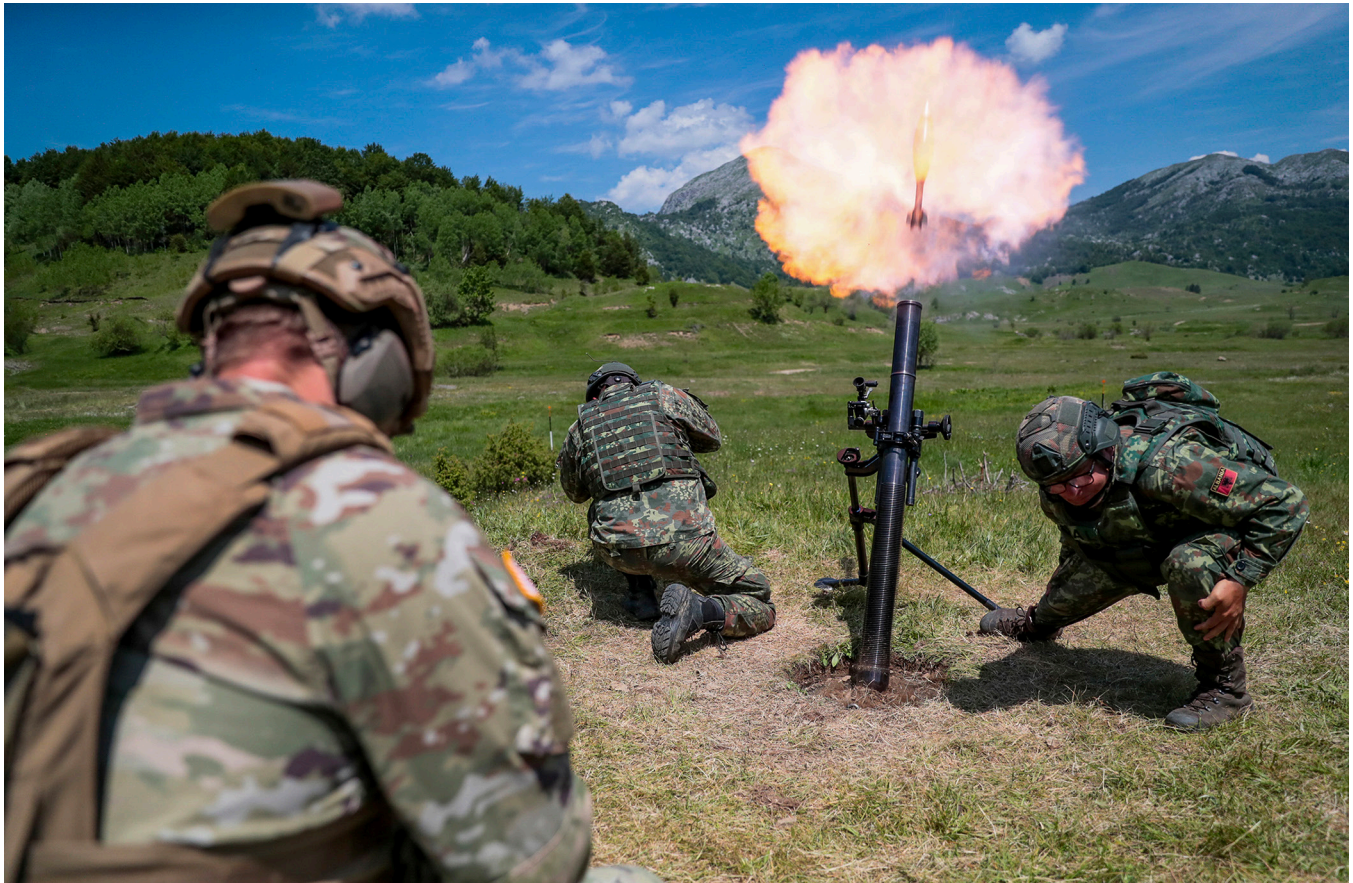
Below: A U.S. Army Soldier with the Observer Coach/Trainer Operations Group observes Albanian Armed Forces Light Infantry conduct live mortar fire training in Bizë, Albania, June 5, 2025.