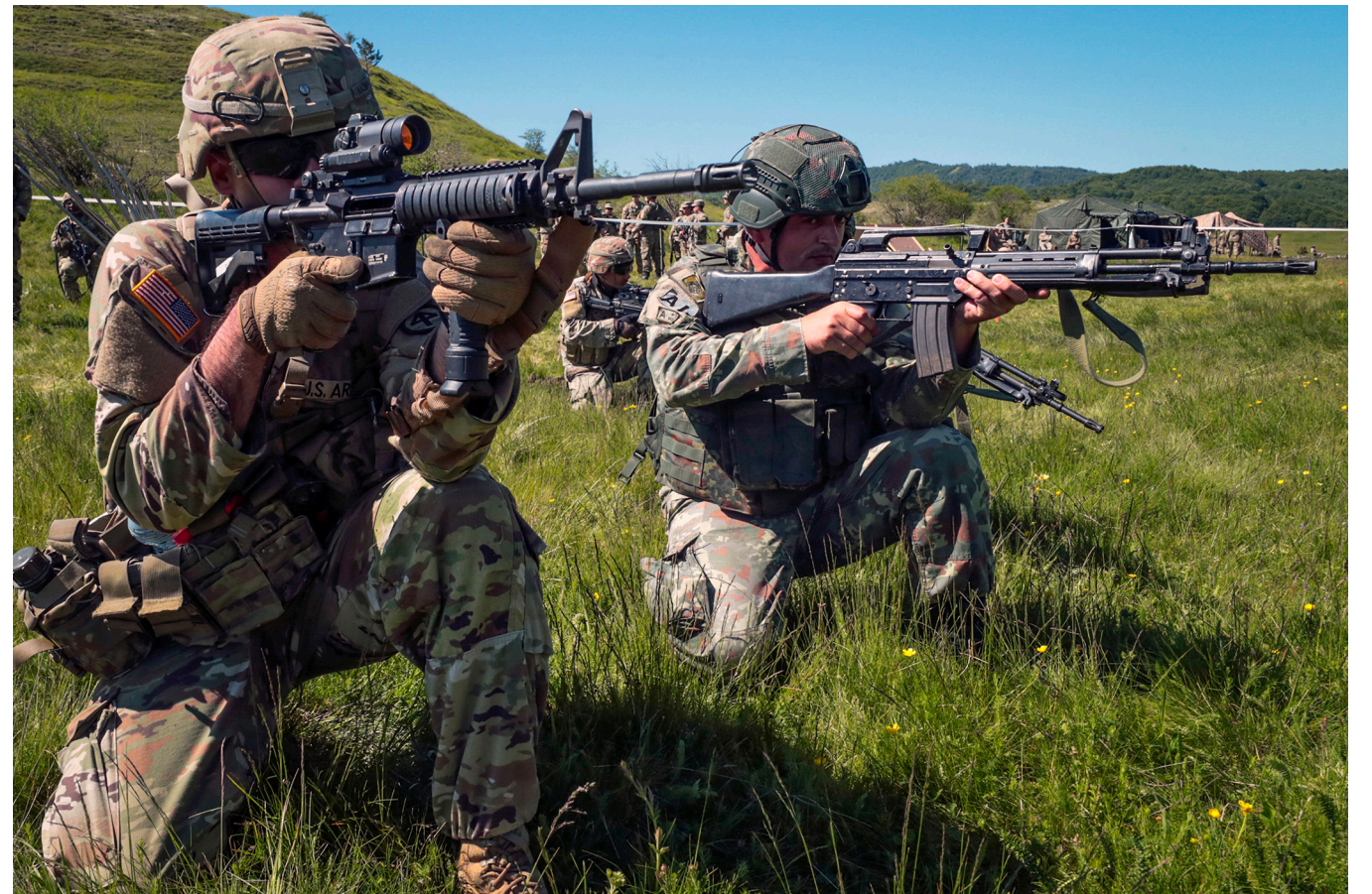
Above: U.S. Army combat engineers with the 104th Brigade Engineer Battalion participate in simulated buddy fire teams with Albanian Land Force soldiers in Bizë, Albania, June 3, 2025.