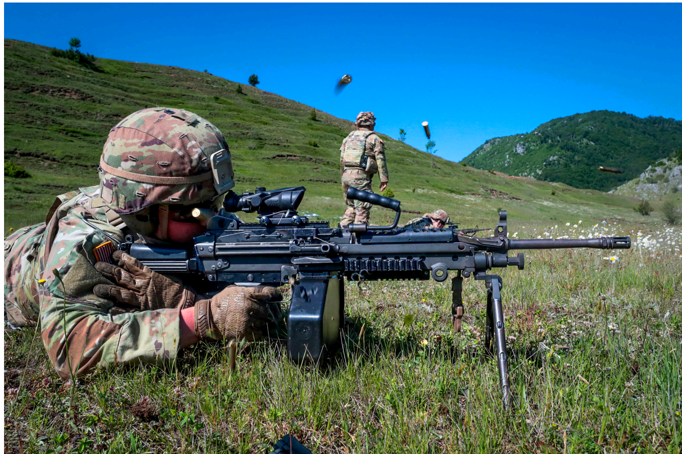
Above: U.S. Army combat engineers with the 104th Brigade Engineer Battalion, conduct live fire drills in Bizë, Albania, June 4, 2025.