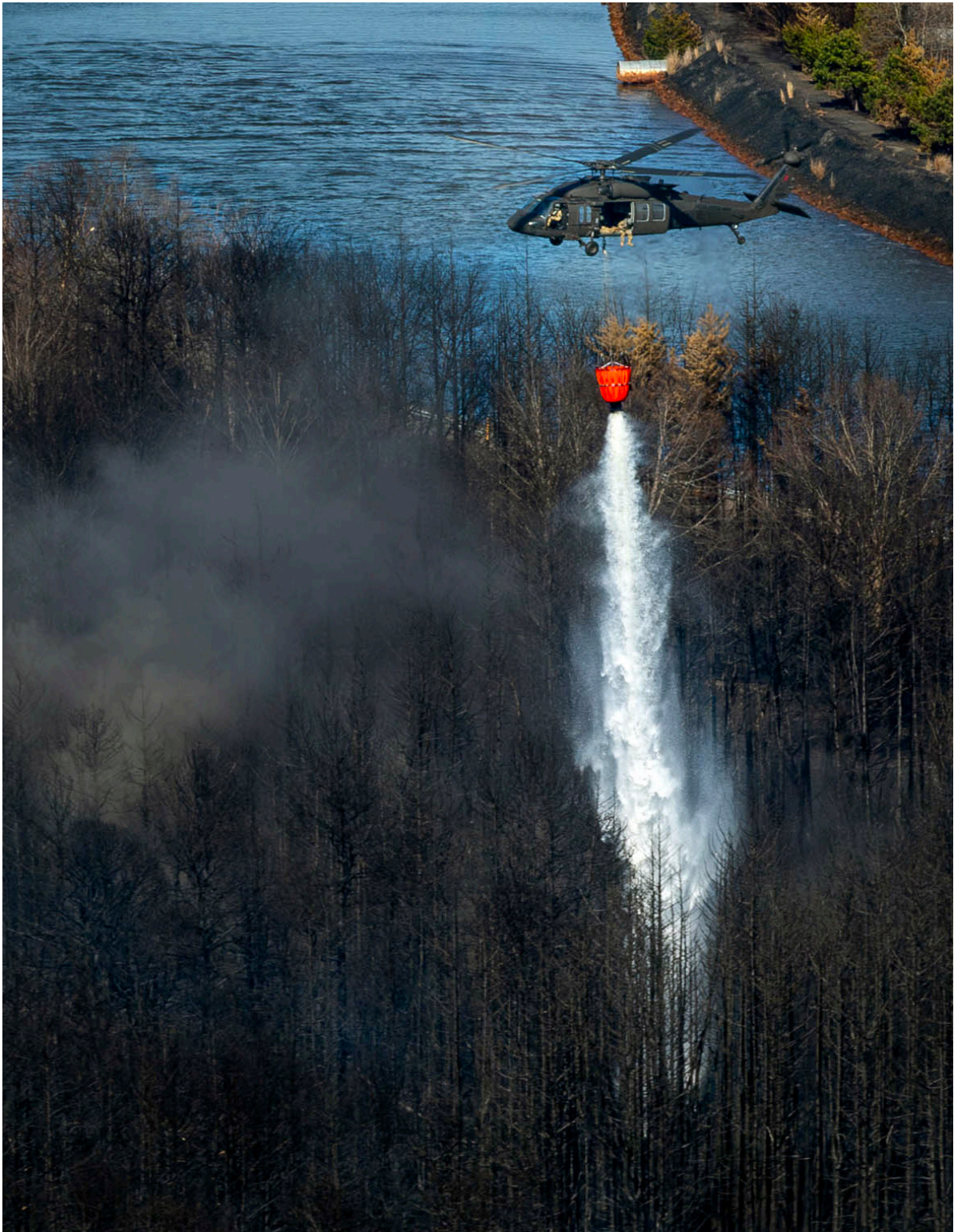
A U.S. Army UH-60M Black Hawk helicopter with the 1st Battalion, 150th Assault Helicopter Regiment, New Jersey Army National Guard, uses a helicopter bucket to extinguish wildfire in Ocean County, New Jersey, April 28, 2025. New Jersey National Guard Soldiers, Airmen, and state civil servants have responded to requests to support ongoing efforts to contain the 15,000-acre wildfire in Ocean County, New Jersey.