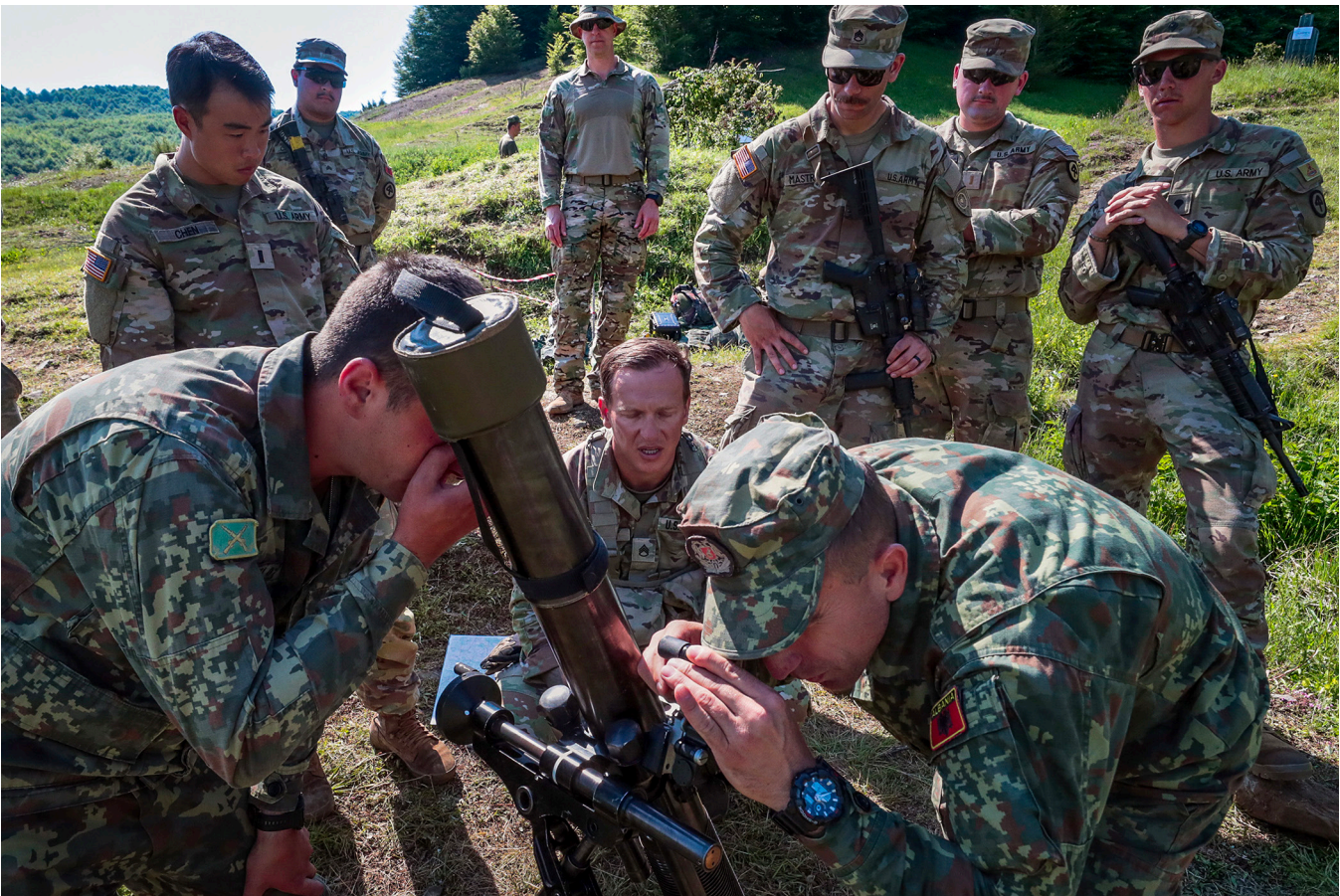
Above: U.S. Army Soldiers with the Observer Coach/Trainer Operations Group observe Albanian Armed Forces Light Infantry and Kosovo Security Forces conduct live mortar fire training in Bizë, Albania, June 5, 2025.