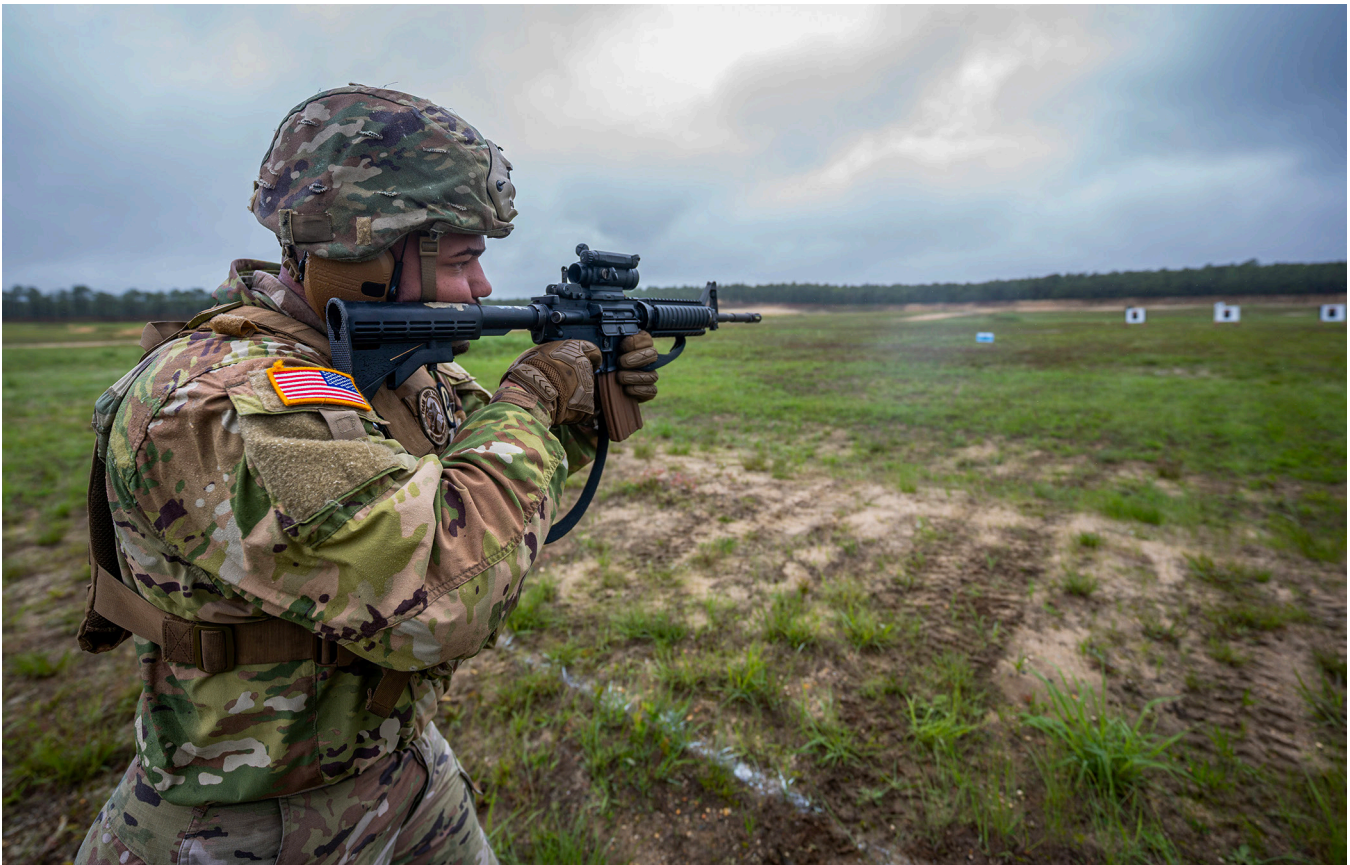
Above: A U.S. Army Soldier, with the New Jersey Army National Guard, fires an M4 carbine at Joint Base McGuire-Dix-Lakehurst, New Jersey, May 22, 2025.