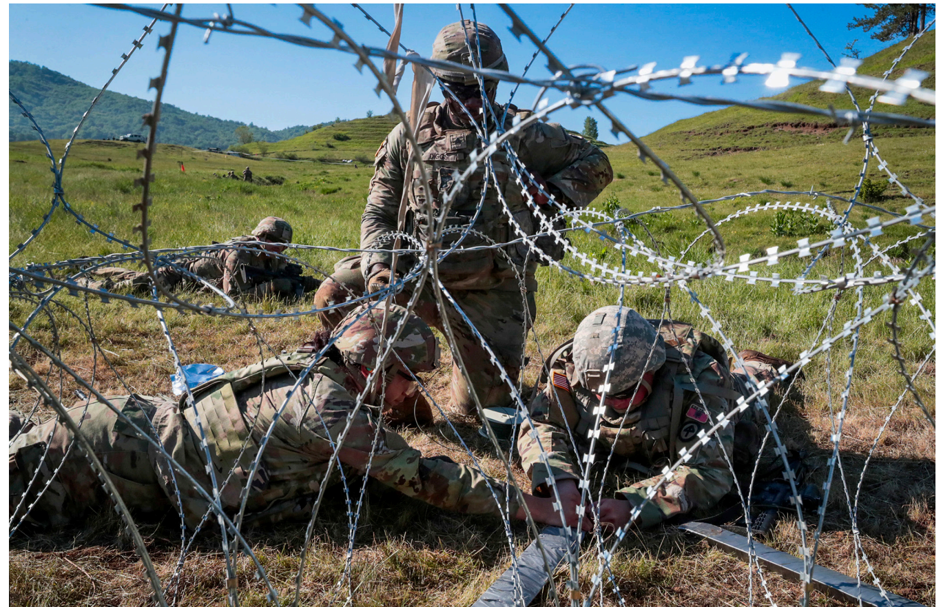
Below: U.S. Army combat engineers with the 104th Brigade Engineer Battalion, place improvised Bangalore torpedoes to cut concertina wire in Bizë, Albania, June 4, 2025.