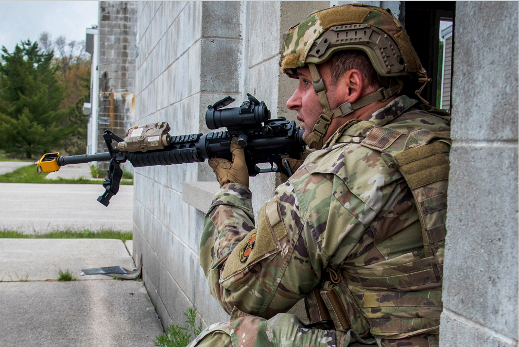
U.S. Air Force Airmen with the 108th Security Forces Squadron, New Jersey Air National Guard, participate in a combat readiness exercise at the Alpena Combat Readiness Training Center, Alpena, Michigan on May 16, 2025. This exercise tested the wing’s ability to generate, employ and sustain wartime, contingency, and force sustainment missions in the U.S. Indo-Pacific Command area of responsibility and their ability to operate and survive against enemy threats.