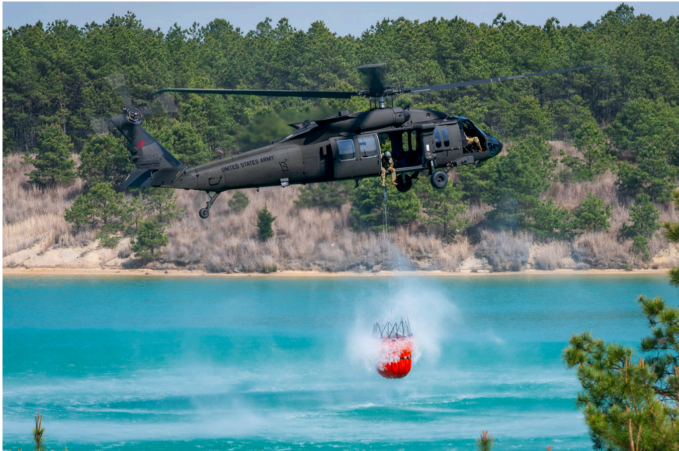
Above: A NJARNG UH-60M Black Hawk helicopter fills a helicopter bucket to fight the Ocean County wildfires April 24, 2024.